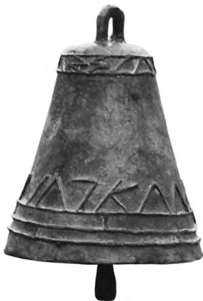
Niezapominjaka Cast bronze H: 30 cm, Ø: 22 cm Warsaw, June 2016